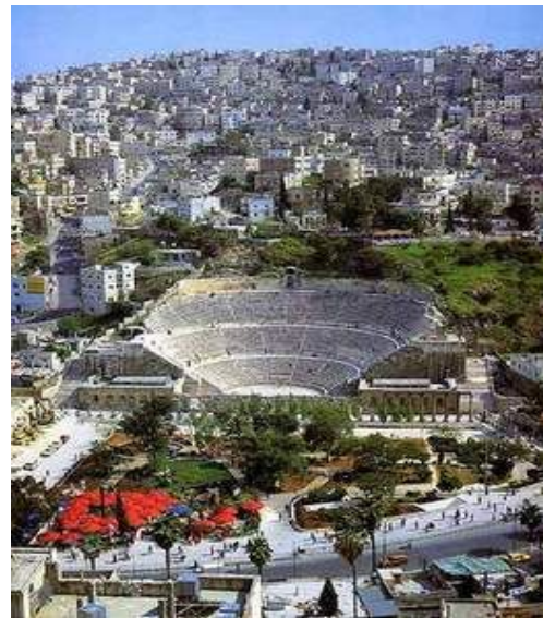
The Roman Amphitheatre