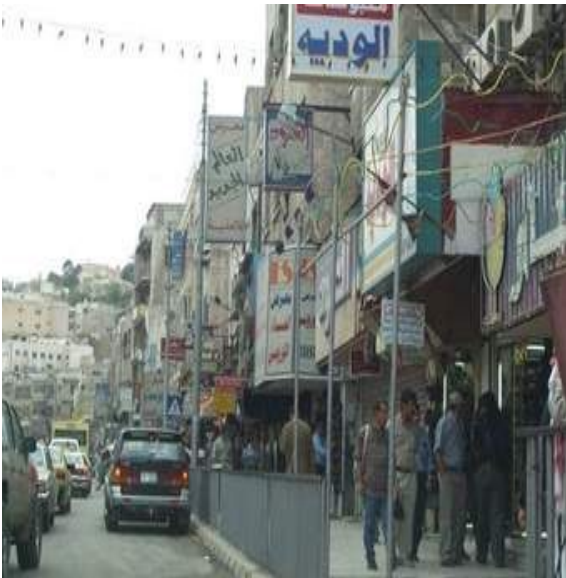
Down Town Amman